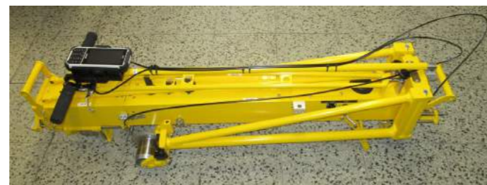
For easier transportation the trolley can be easily fold